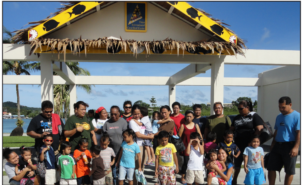
Day Care kids with teachers and parents at PICRC entrance.

PCC Belau Day Care wants to thank PICRC management and the Aquarium staff for this great learning opportunity and exciting field trip for the kids.