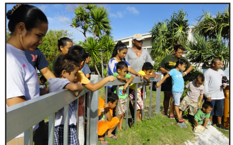
Day Care kids with parents and teachers.

Happy Valentines to all Elementary, High School, and PCC Students in Palau.