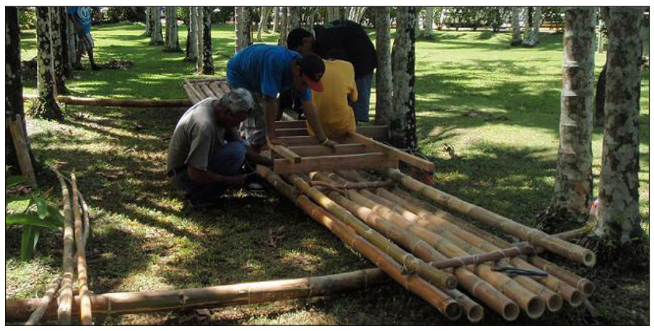
Summer Youth Program participants learning how to make a bamboo raft.