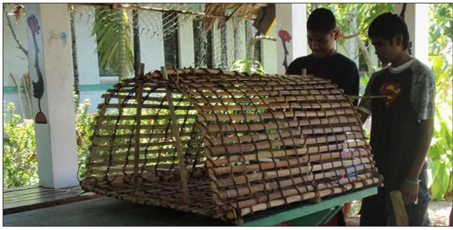
Summer Youth Program participants learning how to build a fish trap.

The summer program organized by the Continuing Education (CE) Department of Palau Community College (PCC) is promoting cultural appreciation in young Palauans by providing hands-on experiences, such as building bamboo rafts and learning traditional chanting. Over the summer, the youth will be exposed to cultural practices providing an understanding of Palauan culture in light of today's difference in culture. As western practices slowly creep in to replace traditions, this program aims to instill a feeling of value for the cultural practices still evident in Palau.