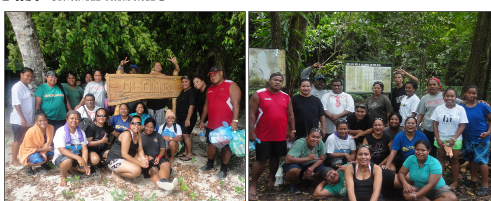
HI-189 class exploring Ulong Island.

Students were ambitious and determined to explore the entire island. They were able to explore traditional sites such as the cave, stone paths, clay potteries, pictograph, water-well; and examine domesticated plants such as bananas, papayas, and taro. The students were amazed by the natural wonders and quietness of the island that they could have felt the spirits of their ancestors illuminating their minds. They were fortunate to witness another aspect of Palau's culture as they observed the newly hatched sea turtles exiting their nest and heading out to the sea.