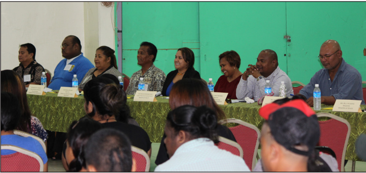
Panel of Guest Speakers at the PCC Career Expo.