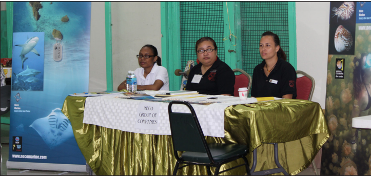
One of the information booths (Neco Group of Companies) at the Expo.

Palau Community College held its first Career Expo on October 31st, 2013 at the PCC Cafeteria. The theme of the Career Expo was “BE INFORMED! MAKE THE RIGHT CAREER CHOICE!” The Career Expo is to help PCC students learn about available job opportunities and gain information to help them identify future careers, or majors to pursue when they transfer to universities.