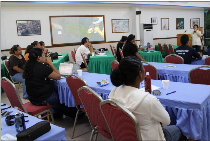
Attendants of the Protocol & Conference Management Training at the PCC Assembly Hall.

A course on Protocol and Conference Management was held at the Palau Community College (PCC) Assembly Hall from Wednesday, March 26, 2014 to Friday, March 28, 2014. During the three-day course, participants were taught about the basic elements and application of Protocol as well as the concepts of conference management. The training aimed to teach the necessary diplomatic skills to individuals working in areas that provide services to foreign nationals.