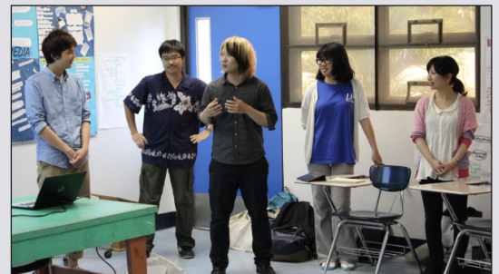
Osaka University students visiting PCC.

By expanding the boundaries of knowledge and promoting collaboration between students in different fields of learning, the program allows young minds to practice creative means of adapting to today’s globalizing world society. During their visit to PCC, the students of Osaka University shared their CBI studies of Palau which covered the mythical and scientific origins of the legendary Badrulchau (giant stone monoliths) of Ngerchelongs.