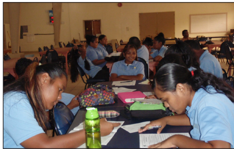
Meeting with students of Palau High School.

For more information regarding the Admissions & Financial Aid for the School Year 2014-2015, you may contact the PCC Office of Admissions & Financial Aid at 488-2470, ext. 235.