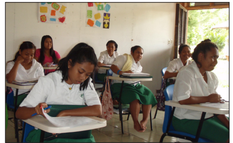
Visiting students at Bethania High School.