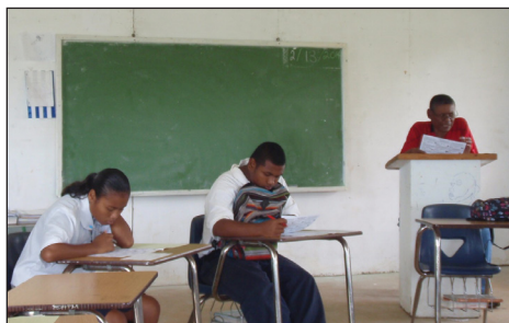
Recruitment at Belau Modekngai High School.