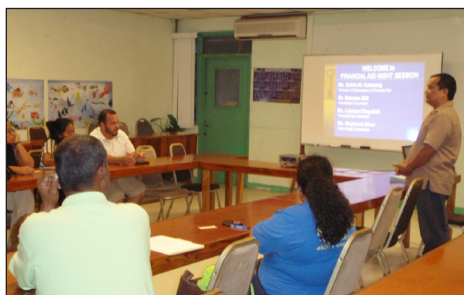
Recruitment meeting at CE Training Room.