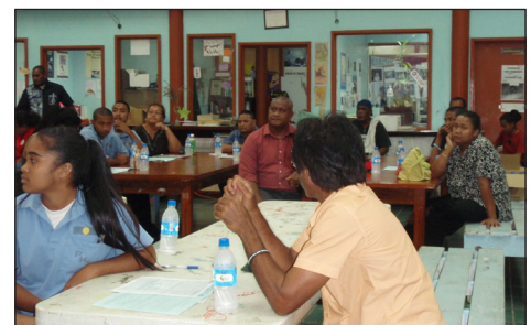
Parents and students at financial aid meeting.