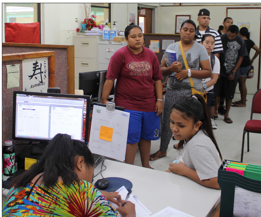
Students register for Fall Semester 2014.

Registration for the new fall semester of Palau Community College (PCC) took place on Monday, August 11, 2014 to Wednesday, August 13, 2014. Continuing and returning students gathered at the campus of the school to meet with their academic advisors at the Student Life division of the college. During their meetings, students discussed their educational goals and future plans with their counselors. Students also selected their classes and set their official schedules for the new semester. Over a hundred-eighty (180) new students have been accepted this new school year.