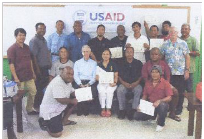
Participants of the Stand-Alone Photo-Voltaic Training Sessions attending the certification ceremony.