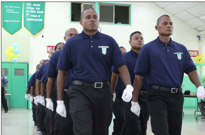
Cadets marching in during the 21 st Law Enforcement Graduation.