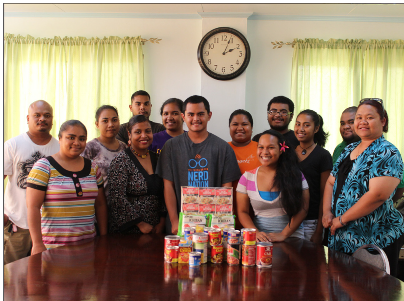
Members of the Phi Theta Kappa International Honor Society with the PCAA staff

On Thursday, December 18, 2014 members of the Phi Theta Kappa (PTK) International Honor Society donated to the Palau Community Action Agency (PCAA) - Head Start Program. The donation was made possible through the Project Graduation , a donation run that the PTK members conducted during the graduation day of PCC that solicited in-kind food supply donations from members of the community.