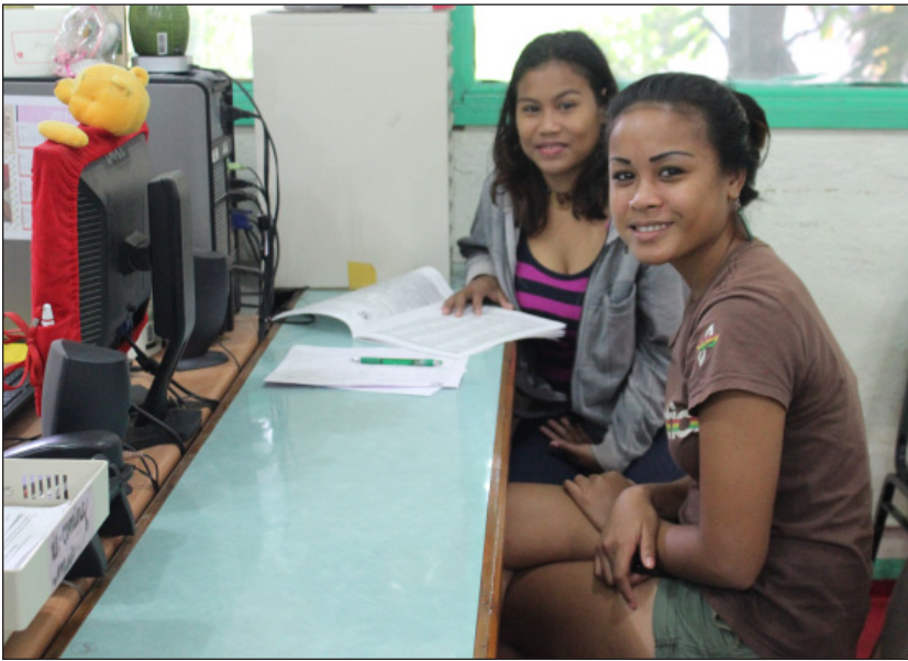
Students at the Student Life Office registering for the new spring semester

From January 12, 2015 to January 14, 2015 the registration process for the new spring semester of Palau Community College (PCC) was conducted. Returning students and new students flooded the campus to meet with their academic advisers. During their meetings, the Student Life academic advisers helped the students plan their academic calendars for the new semester.