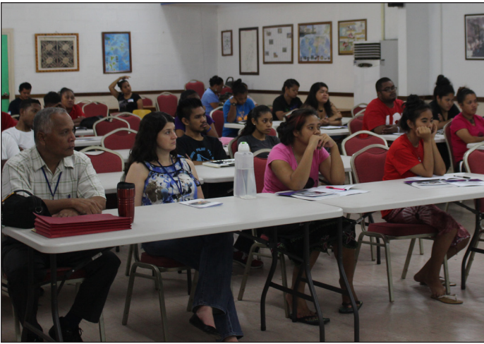
New students and academic counselors attending the New Student Orientation for Spring Semester 2015