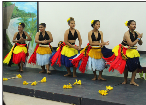
Delal a Ngloik performance courtesy of eighth grade students from Koror Elementary School