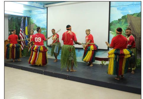
PCC Yap Student Organization performing a traditional stick dance