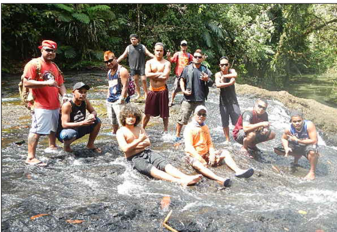
Dorm students spending the afternoon at the Tabcheding Waterfall