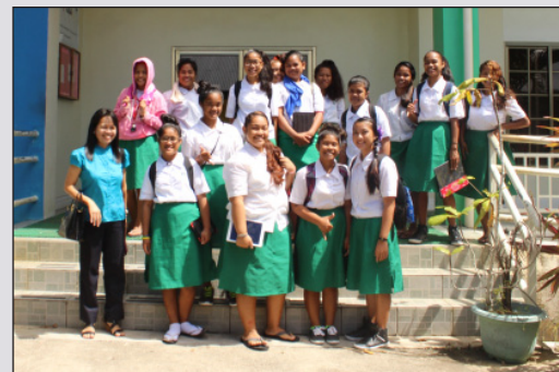
Bethania High School students and their teacher posing in front of the Tan Siu Lin PCC Library

A group of students and their teacher from Bethania High School (BHS) toured the Tan Siu Lin Palau Community College (PCC) Library on Tuesday, March 24, 2015. The group consisted of sophomore and junior students. During their tour, the PCC library staff was on hand to teach the students how to access and use the online library catalog. The online library catalog is a database that contains a list of books, magazine, and other reading materials available at the PCC Library. Also included in the online catalog are listings from other libraries in Palau, such as the libraries at the Belau National Museum and the Olbiil Era Kelulau (OEK). The students' tour also included an introduction to the many learning resources available at the PCC Library. After visiting PCC, the BHS students toured the Palau Public Library.