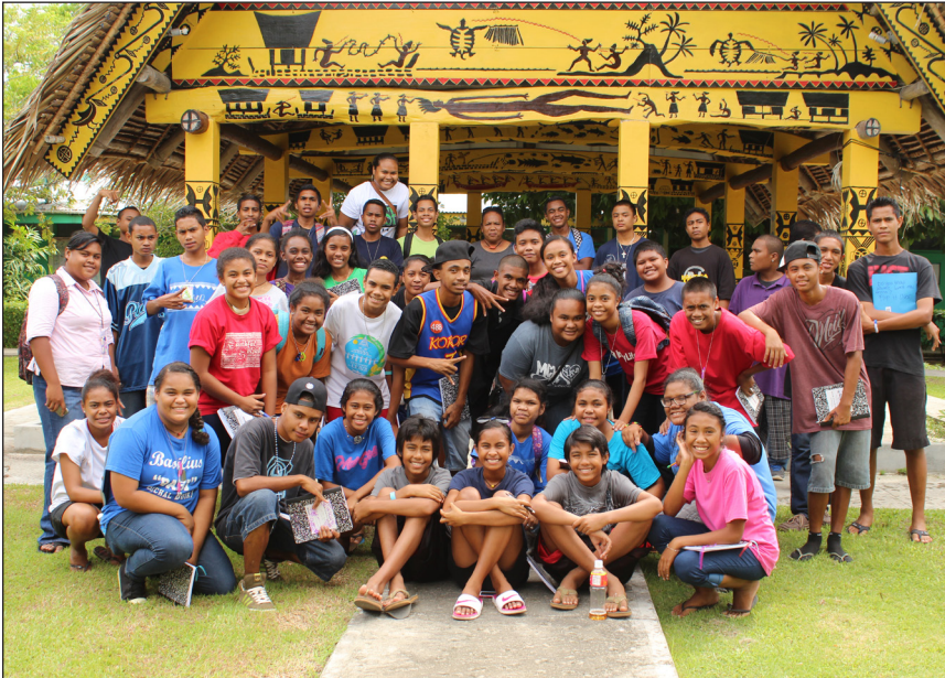
High school students participating in the College Readiness Institute Summer Program

On Thursday, June 18, 2015 a group of high school students participating in the College Readiness Institute Summer Program (CRISP) toured the campus of Palau Community College (PCC). A total of forty-three (43) students entering their sophomore year of high school are participating in this year's summer program: forty (40) from Palau High School, two (2) from Mindszenty High School, and one (1) from Bethania High School.