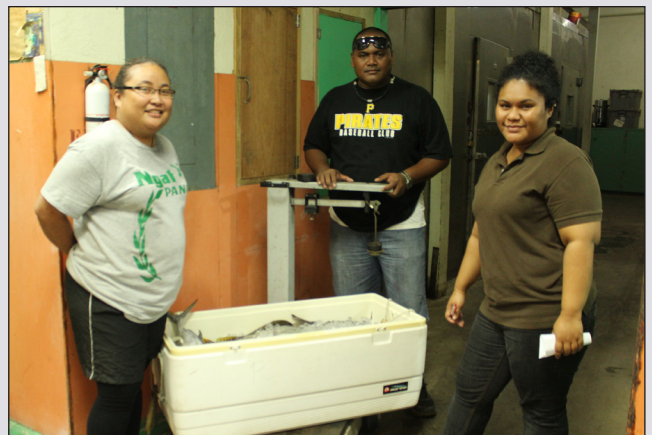
PCC Cafeteria staff receiving the donation from Ngatpang State

On Tuesday, June 23, 2015 the Cafeteria of Palau Community College (PCC) received a donation of 120 lbs. of reef fish from Ngatpang State. PCC would like to thank Ngatpang State for its generous donation!