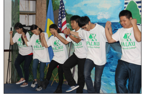
The Taiwan Youth Ambassadors performing a dance for the PCC students