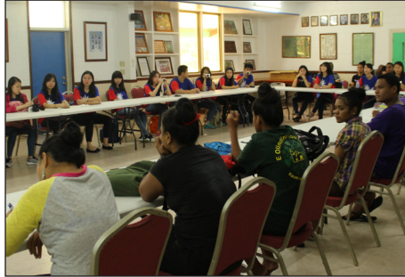
PCC students meeting with the Taiwan Youth Ambassadors at the PCC Assembly Hall

The International Youth Ambassadors Exchange Program provides Taiwan youth with the opportunity to broaden their knowledge of international affairs. Since 2009, university students from Taiwan have visited nations around the world to promote their cultural heritage as well as learn about the influence that Taiwan has had on different sectors in respective countries. This year's exchange program was an opportunity for the students to highlight Taiwan's interest in humanitarian aid and global sustainability.