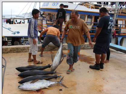
The yellow fin tuna that was donated by the Division of Marine Law Enforcement

On December 11, 2015 Palau Community College (PCC) received a donation of fish from the Division of Marine Law Enforcement under the Ministry of Justice. The division generously donated a hundred-and-eighty pound (180lbs.) of yellow fin tuna the cafeteria of the college. PCC thanks the Division of Marine Law Enforcement for its donation!