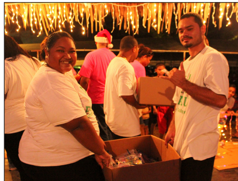
PCC Music Club Members acting as Santa's Helpers for the evening

The Bethlehem Park Children's Christmas Program is an annual event organized to promote the feeling of holiday spirit in the community. PCC has been actively involved in this annual program since its inception.