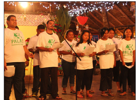
The PCC Music Club singing holiday songs at Bethlehem Park