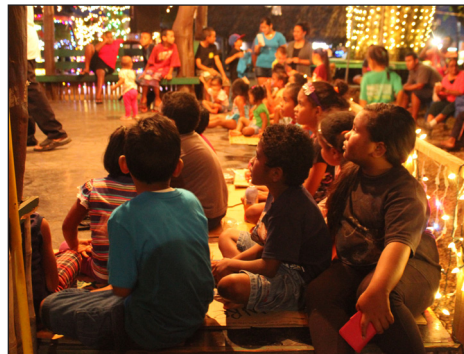
Children enjoying the PCC Music Club performance of favorite Christmas carols