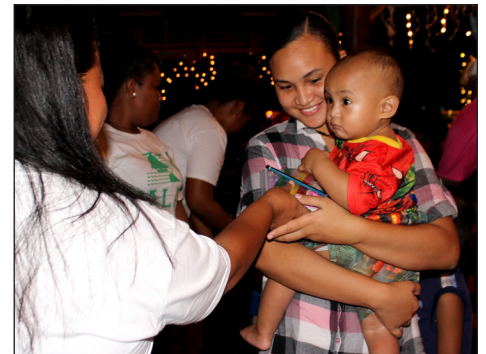
A little boy receiving a gift from one of PCC Santa's Helpers