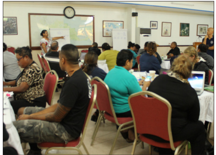
The Ministry of Health Workshop held at the PCC Assembly Hall

The Health Planning Policy Preparedness & Research Development (HPPPRD) Division of the Palau Ministry of Health (MOH) hosted a four-day workshop at the Assembly Hall of Palau Community College (PCC) from Monday, February 01, 2016 to Thursday, February 04, 2016. The workshop focused on providing local emergency response teams with the necessary training regarding the incident command system. The incident command system is a standardized approach to the command, control, and coordination of emergency response providing a common hierarchy within which responders from multiple agencies can follow to achieve effectiveness.