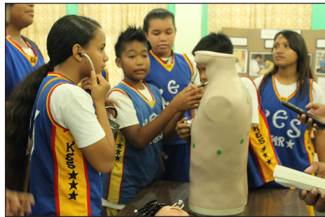
Koror Elementary School Students learning about the PCC Nursing Program

CTE Awareness Week is an annual event hosted by PCC. It brings in elementary students, high school students, and interested members of the community to the campus to learn about the programs & services available at the college. The college also aims to encourage prospective students from local high schools to enroll at Palau's only institute of higher learning by exposing them to its campus environment and programs.