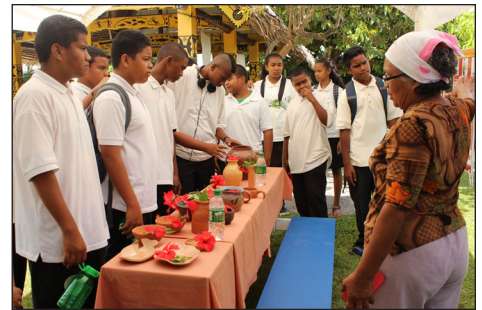
Melekeok Elementary School Students learning about the Palauan Studies Program