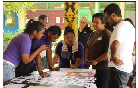
Palau High School Senior Students learning about the PCC Liberal Arts Program