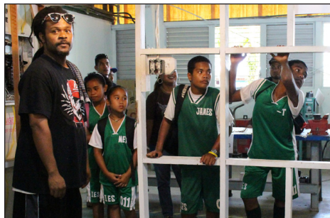
Meyuns Elementary School Students learning about the Electrical Technology Program