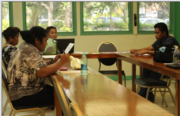
Graduation Committee meeting at the CE Training Room

Members of the graduation committee of Palau Community College (PCC) have been meeting regularly to prepare for the upcoming 53 rd Commencement Exercises of the college. The committee is in charge of catering, logistics, program & script, and awards. During the meeting, the committee members provided updates on their respective tasks. Meetings with perspective students will also be held in order to schedule march practices and finalize details. The graduation is scheduled for Friday, May 13, 2016.