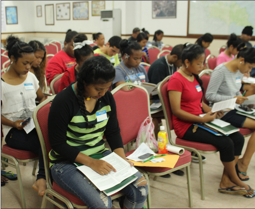
Summer 2016 New Student Orientation at the PCC Assembly Hall

An orientation for the new students enrolled in the upcoming summer semester was held on Tuesday, May 31, 2016 at the Assembly Hall of Palau Community College (PCC). Organized by the Student Life & Housing Unit, the orientation was an opportunity for the college staff to assist new students transition from a high school environment to a college environment. The college staff focused on explaining the support services and learning resources available that may help each student succeed academically.