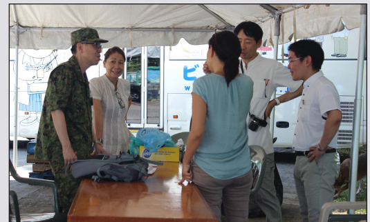
Pacific Partnership 2016 team members providing medical services to the community of Palau

Palau Community College (PCC) is currently the host site for the medical, dental, and eye services being offered through the 2016 Pacific Partnership. From Friday, August 05, 2016 to Saturday, August 13, 2016 military service members from Japan, Australia, the United Kingdom, and the United States will conduct cooperative health engagements for the community of Palau. The service members will also participate in expert exchanges with the medical and civil-engineering teams in Palau in order to improve the island's collective ability to respond to a variety of natural disasters. The medical services being offered are free to all community members. Those interested in taking advantage of the free medical services may visit the college for further assistance. Initiated in 2007, the Pacific Partnership is a multi-national goodwill mission that promotes visits to countries in the Pacific region in order to provide medical care, civil-engineering support, and cultural exchanges.