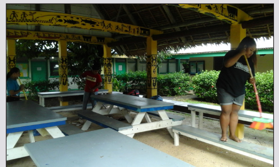
The PCC students who have been diligently cleaning the PCC Mesekiu Bai every morning