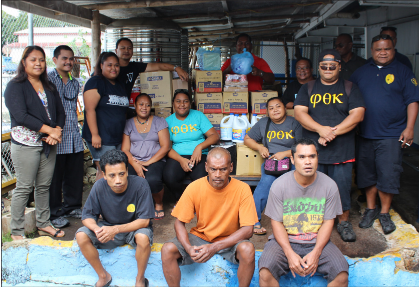
Members of the Phi Theta Kappa Society - Beta Omicron Zeta Chapter presenting donations to the Division of Corrections under the Palau Bureau of Public Safety

On Thursday, November 10, 2016 the members of the Phi Theta Kappa International Honors Society - Beta Omicron Zeta Chapter (PTK-BOZ) donated nonperishable supplies to the Division of Corrections under the Bureau of Public Safety at the Ministry of Justice. The nonperishable supplies donated included items such as cleaning supplies. These items were donated by community members during the PTK-BOZ Project Graduation Event on Friday, May 06, 2016.