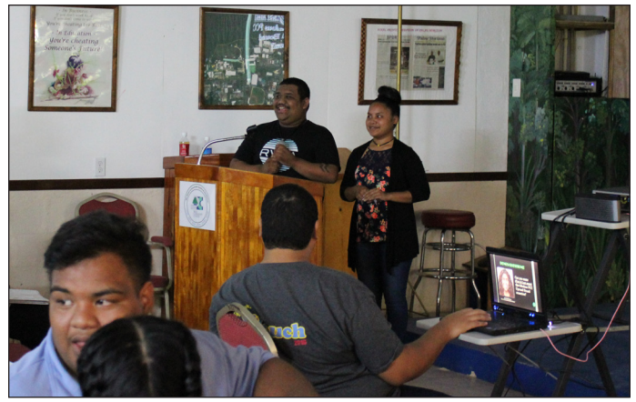
PCC IT Program Students presenting about the benefits of their field of study to the students of the Upward Bound Program

On Friday, January 20, 2017 an Upward Bound Program Workshop featuring a presentation about the Information Technology Program at Palau Community College (PCC) was held at the PCC Assembly Hall. Presenters were PCC students enrolled in the degree program. By sharing their learning experience, the students aimed to promote an interest among high school seniors and increase enrollment in that particular field of study. The PCC students began with an introduction of the program. They highlighted the general education & course requirements that must be met in order to complete the degree program. Students who enroll in the IT Program will learn about the basic skills necessary for careers in the field of information technology such as web design, computer programming, computer networking, and computerrelated troubleshooting. Upward, continued on page 4