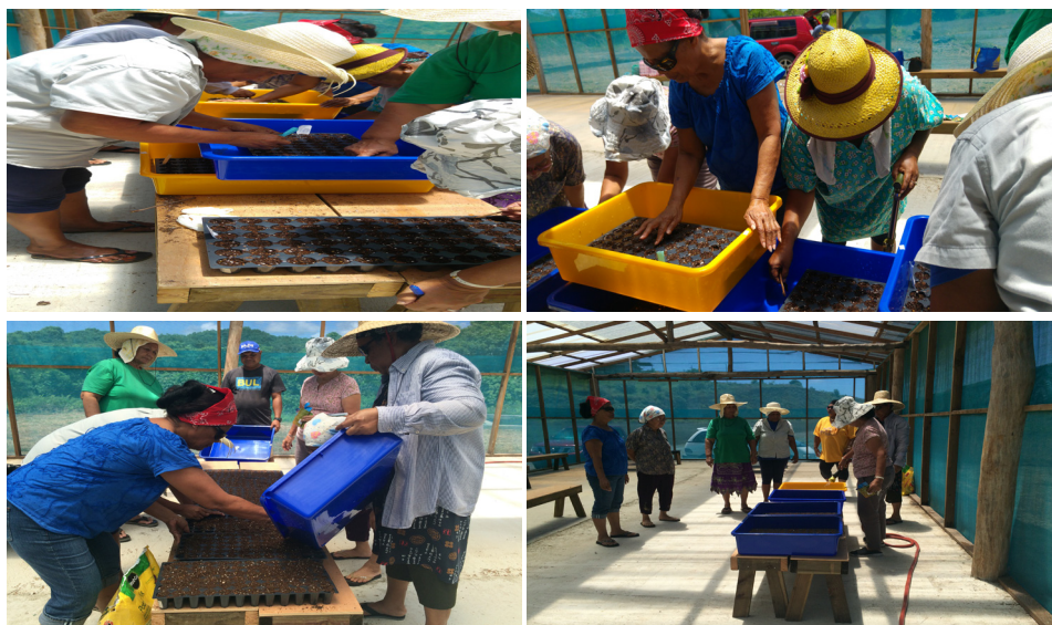
Oldia's Women's Association (OWA) members take part in the recent Seed Management and Maintenance Training/Workshop at the Hydroponics Green House Facility in Ngchesar