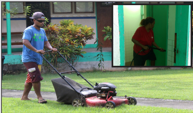
Workers cleaning PCC upper-campus

PCC would like to thank the maintenance workers and students for assisting in beautifying the college campus!