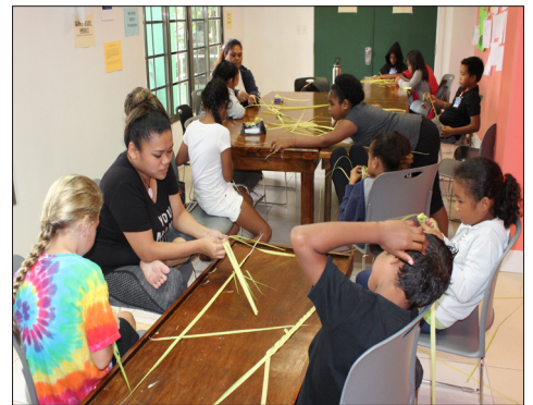
Students participating in the PCC Library Summer Activities Program