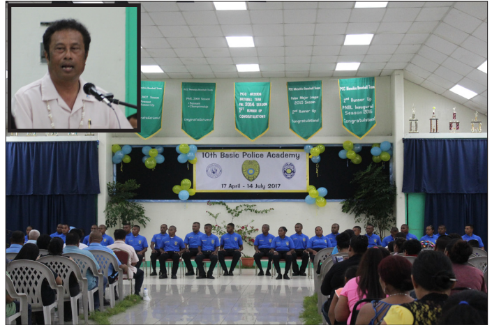
Participants of the Basic Police Academy

On Friday, July 14, 2017, the 10 th Basic Police Academy graduation ceremony was held at the Palau Community College (PCC) Cafeteria.