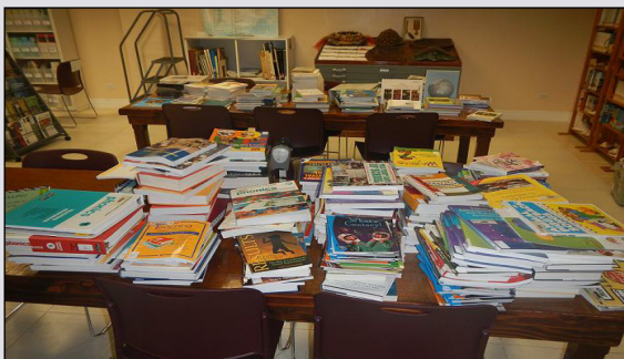
Books donated to the PCC Library from PREL.