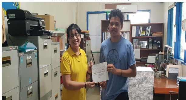
Ngiwal State Gov't purchased tickets worth $200