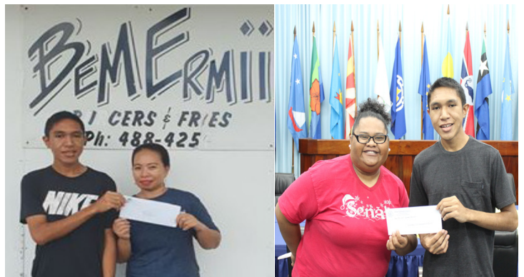
Bem Ermii donated $100