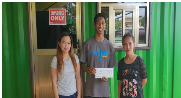
Palau Water donated $200