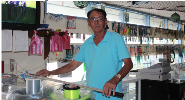
R & C Bait and Tackle in-kind donations