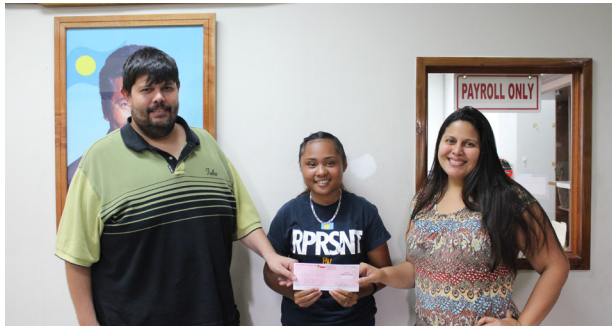
Surangel & Sons Co. donated $5,000

The Palau Community College (PCC) continues to receive additional support from the local government, businesses, friends, and individuals who in the spirit of thanksgiving purchase raffle drawing tickets, give cash donations, and/or in-kind donation to support the college. PCC welcomes all interested groups and/or individuals who wish to buy tickets and/or donate to contact Development Office at 488-2470/1 extension 251, 252, and 253.