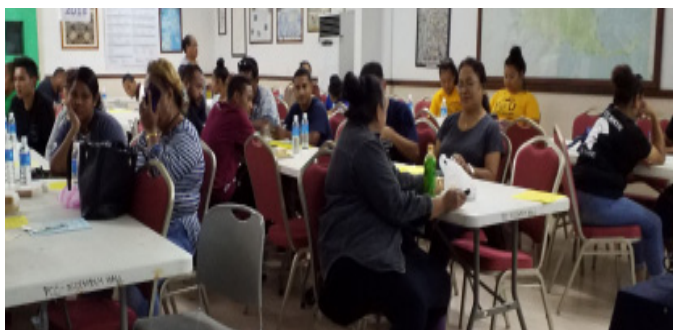
Emmaus-Bethania High School students and parents