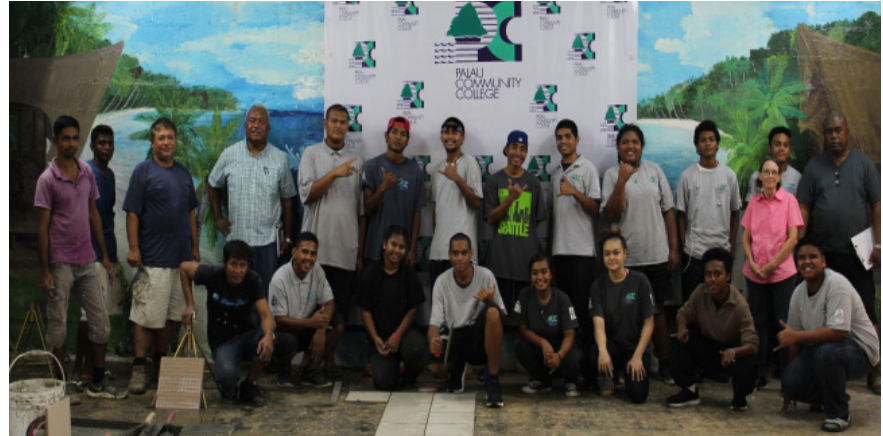
PCC CTE Lab School students laying ceramic tiles as part of their CT class requirement