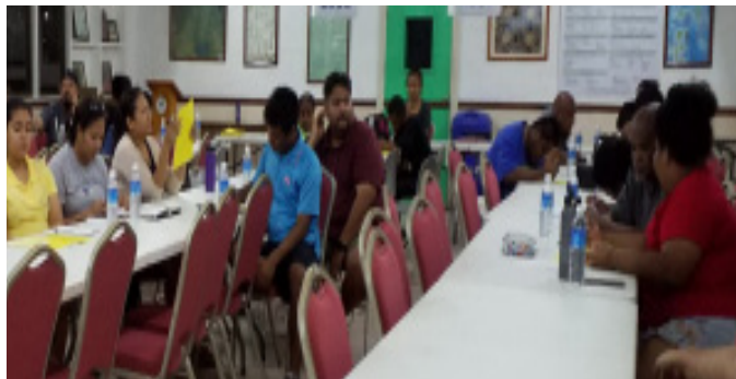
Palau Mission Academy students and parents