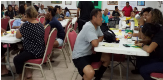
Palau High School students and parents