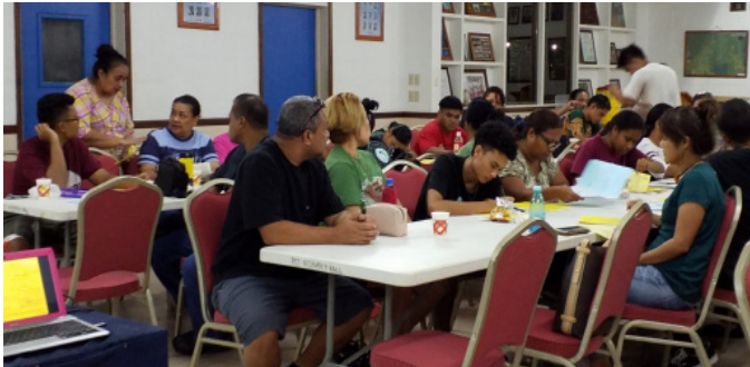
Mindszenty High School seniors and parents

for Federal Student Aid (FAFSA) to complete with the assistance of the director and the financial aid staff. Of the 177 eligible high school seniors, 131 (74%) and their parents attended the Financial Aid Night sessions. We will continue to reach out to the remaining 46 (26%) seniors who did not attend the session and offer assistance to them and help them file the 2019-2020 FAFSA if they are planning to attend college from July 1, 2019 to June 30, 2020.