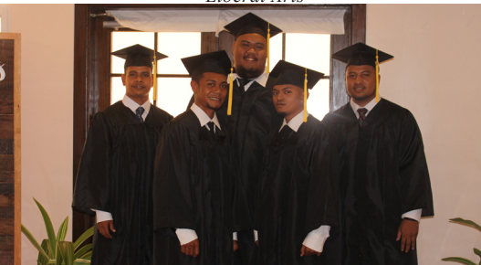
Small Engine & Outboard Marine Technology