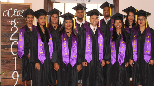
Tourism & Hospitality