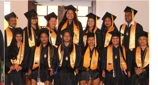
Phi Theta Kappa - Honor Society