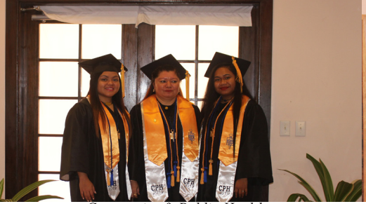
Community & Public Health