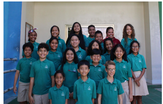
SDA Elementary School 5 th Graders

One of the fundamental protocol stated in the framework is the code of ethics which require emergency medical service personnel to save life, alleviate suffering, promote health, and to encourage quality and equal availability of emergency medical care.