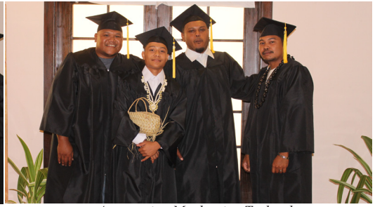
Automotive Mechanics Technology