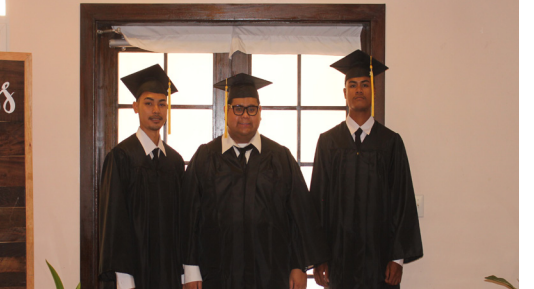
General Electronics Technology