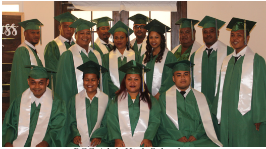
PCC Adult High School