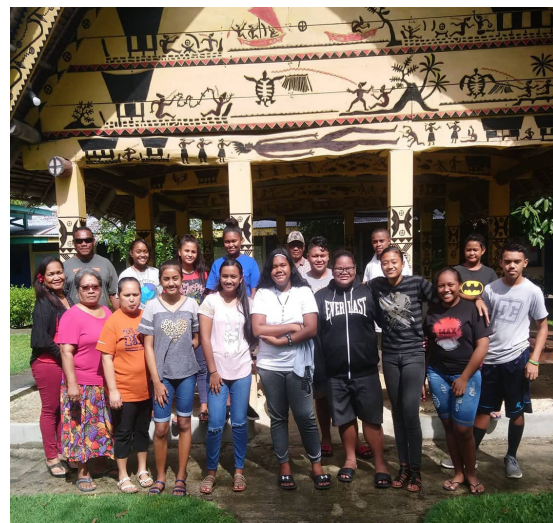
KSG staff and students during arts and crafts session