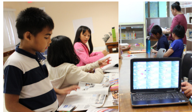
KSG staff and students during arts and crafts session

On June 3 -7, 2019 PCC Library held a one-week summer kids program for ages 7 to 12. The program provides both fun and learning in Arts and Crafts, Mathematics, Vocabulary, Reading and Memorizing Games, Scavenger Hunt with prizes, and Online Catalog.