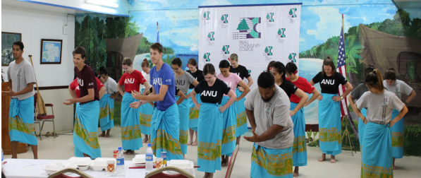
ANU & UH students performing palauan contemporary dance at PCC Assembly Hall