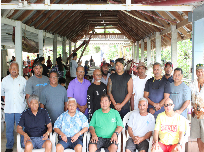
Pwo Ceremony at PCC Taoch era Idederach canoe house with inductees and guests

From July 9-12, 2019 Palau Community College hosted the first Pwo Ceremony at PCC Idederach Canoe House. The four-day training of soon to become master's in traditional navigation required them to stay in the canoe house without leaving the area, dine together with local food and coconut juice until the training is completed.