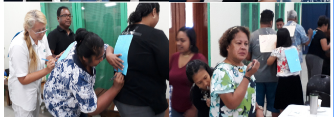
Convocation closing activity