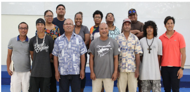
Cooperative Research & Extension