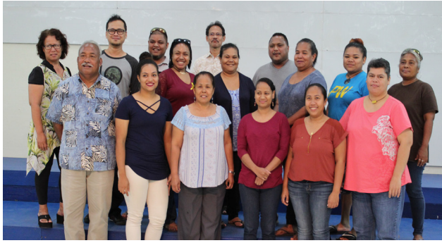
Office of the President