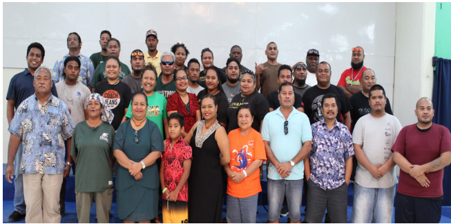
Administration & Finance Department