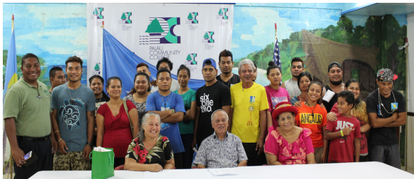
Yapese with FSM Vice President