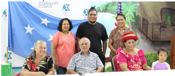
Chukese with FSM Vice President