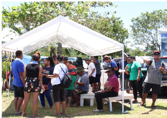
Students & staff during lunch at the college booth