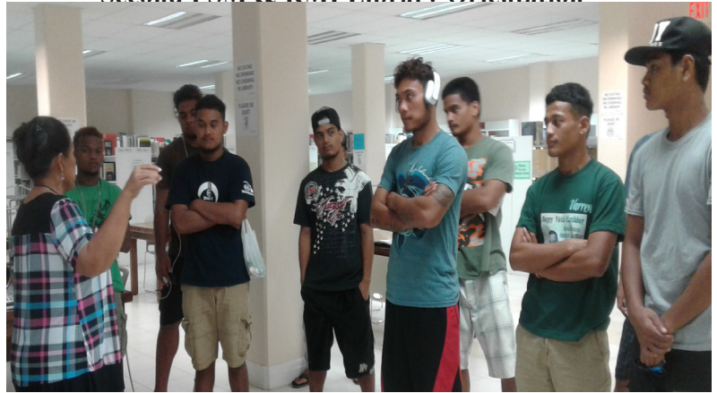
Students from FSM and RMI during library orientation

On September 21, 2019, PCC library held a 2nd FSM & RMI Library Orientation to help students gain knowledge and skills necessary for them to conduct research and obtain reference information on their own. Twelve students participated in the session which included a tour of the library (1st & 2nd floors), an explanation of the kind of information that each section of the library holds, and an opportunity to apply for a free library card.