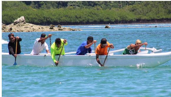
PCC students during canoe racing