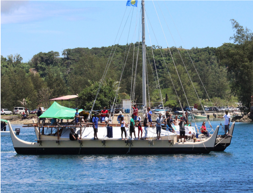
PCC students, staff and faculty on-board Alingano Maisu

On Sunday, September 29, 2019 Palau Community College (PCC) administrators, staff, faculty and students participated in the Republic of Palau 25 th Independence Day flotilla at the Japan-Palau Friendship Bridge.