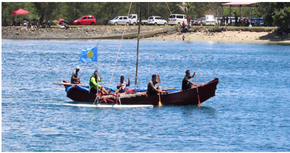
PCC staff paddling traditional canoe during flotilla