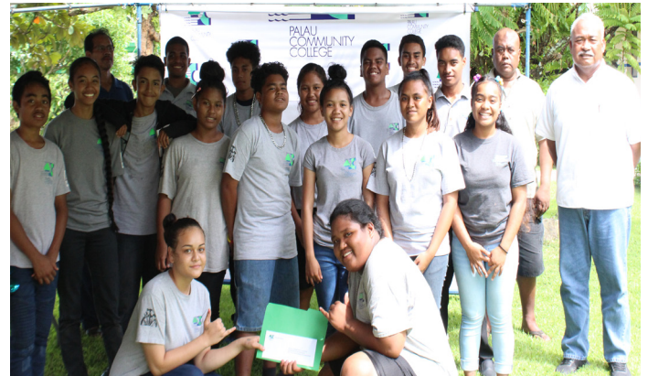
CTE Lab School students donating to PCC Endowment