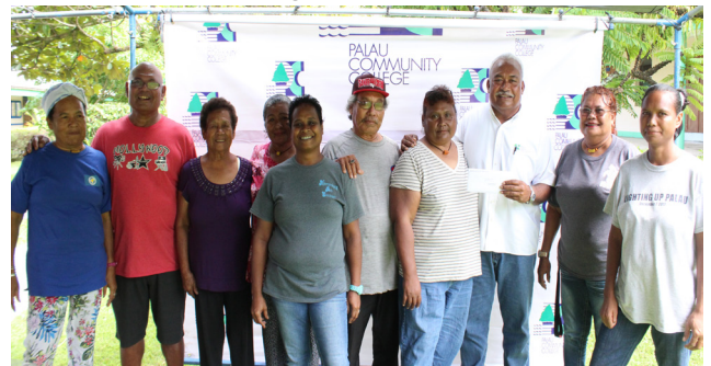
Ngeremlengui Parents Association donating to endowment