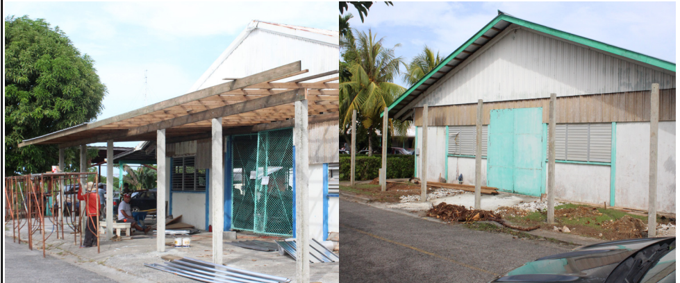
Automotive Mechanic Technology and General Electronics Technology Shops small scale project near completion.