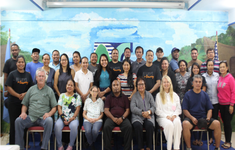
Faculty during training at PCC Assembly Hall

From December 17-18, 2019 Palau Community College faculty attended a two-day online course development using Moodle course program.