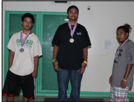
Billiards Male Single winners.