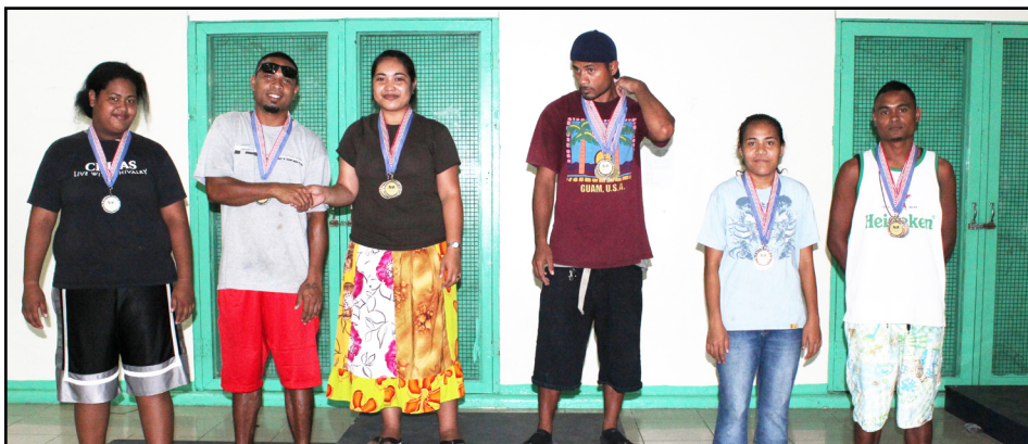
Billiard Mix Double winners.

Every semester the Recreation Office conducts intramural tournaments in Billiards and Table Tennis to currently-enrolled stu-