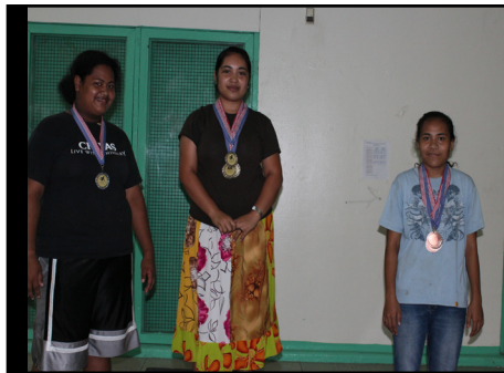
Billiards Female Single winners.