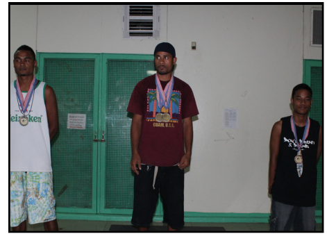
Table Tennis Male Single winners.