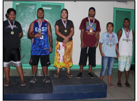
Table Tennis Mix Double winners.