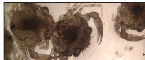
Close-up photo of a 30-32 days old released "chemang" crablets.