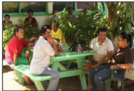
Donors sitting under the kidel tree awaiting the calling of prize winners.

Thank you to the following sponsors for their continuous support and donation of prizes: Cliffside Hotel, Fish 'n Fins, Gibbons Enterprises, Tifuladokow Wood Shop, WCTC and PCC.