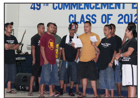
Kosraean students singing a Christmas carol.