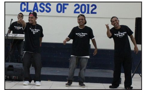
Chuukese group performing a modern dance.

The end of the semester brought the dorm residents together for an end of the year party. With many different ethnicities residing in the dormitories, the program for the evening on Thursday, December 20, 2012 included singing and dance performances by Chuukese, Kosraeans and Yapese students, to name a few. Good food and company provided a great evening for the dorm residents.