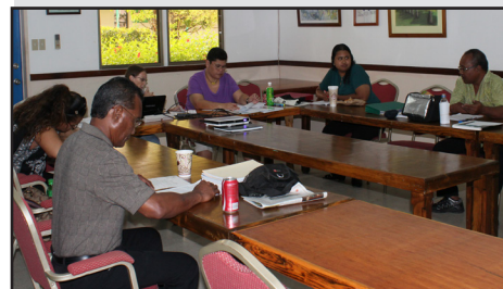
ASC members review the Midterm Report.

Palau Community College is an accessible public educational institution helping to meet the technical, academic, cultural, social, and economic needs of the students and communities by promoting learning opportunities and developing personal excellence.