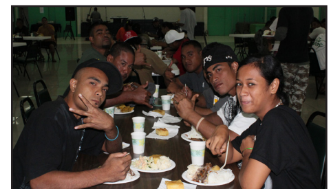
Residents enjoying delicious food.