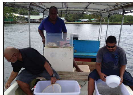
Gov. Wilson Ongos, CRE-VP Taro and aquaculture staff Irvin Dwight releasing crablets near the mangroves at Bkulengriil Conservation Area in Ngeremlengui State.

Currently, 40,000 crablets are being reared in outdoor tanks at the PCC Hatchery for nursery trials. To determine the impact of the release on the re-stocking of mangrove crabs in the above-mentioned conservation areas, a follow-up survey will be conducted by setting up crab traps at strategic locations in the mangroves this coming May 2013.