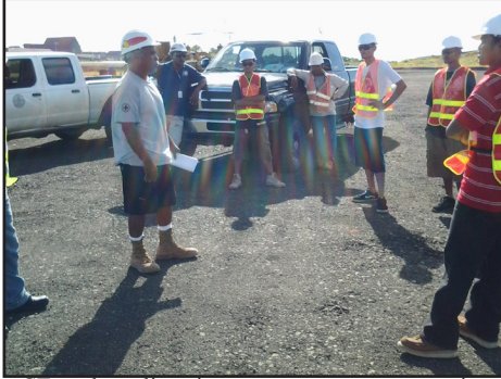
CT students listening to manager at runway site.