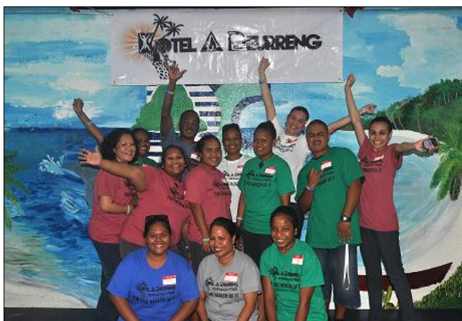
OA-221 Class that organized the “Kotel A Deurreng” youth festival.