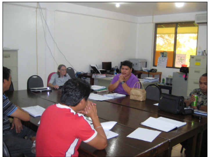
Academic program and department assessment sessions.