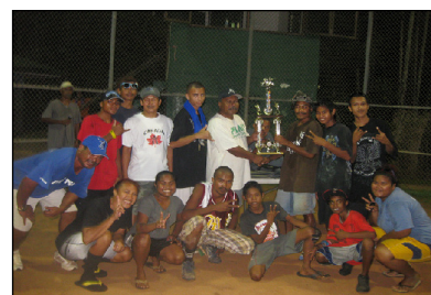
Sportsmanship award being awarded to team Ngerchemai 1010.

The club wishes to thank the teams, PNOC, PSF, PCC, and all those who extended their efforts to help with the fund-raising.