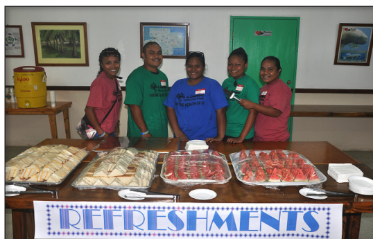
Refreshments table at the "Kotel A Deurreng" festival.