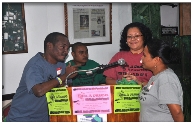
Speakers at the "Kotel A Deurreng" international youth festival.

Over 200 people signed the Go-4-24-Hours , a pledge to stay tobacco free for at least a day, taking the first step toward healthier and happier lifestyles.