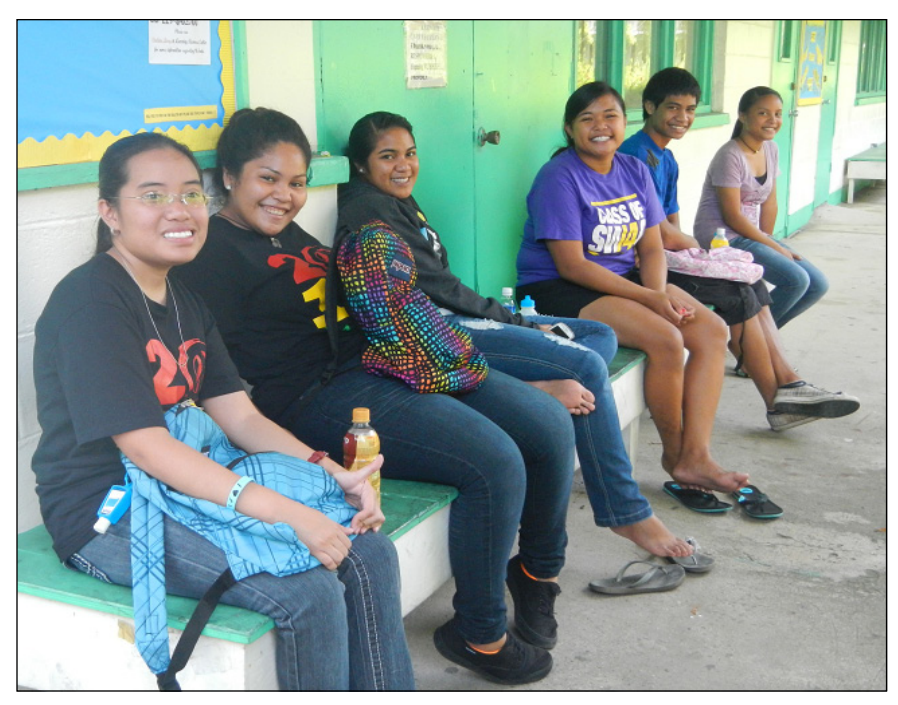
Students around campus enjoying the first week of instruction.

Palau Community College (PCC) began its summer term on Monday, June 10, 2013. New students and returning students roamed about the school campus as they went from class to class. When asked to comment about their expectations for the new school term, students said that they were eager to complete their course requirements though they will miss the months of summer fun.