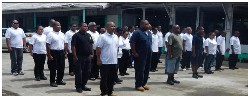
Trainees of the 19th Law Enforcement Academy.

The 19 th Law Enforcement Academy of Palau began its training on June 17, 2013. Within about three months, trainees will be taught about the laws of enforcement inducted in Palau and how to properly apply the knowledge in the community. Trainees include personnel already employed in areas involving law enforcement such as state conservation officers, customs officers, immigration officers, and security officers.