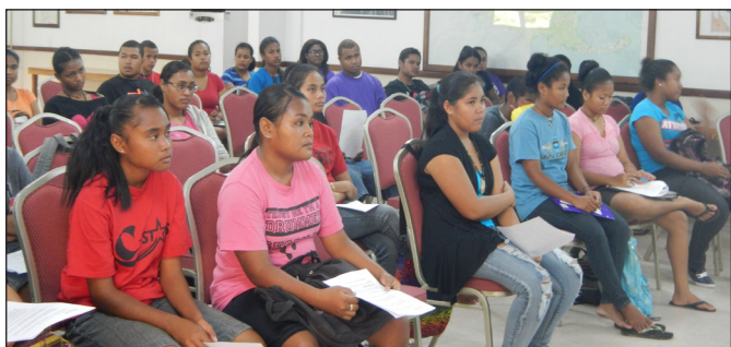
Students participating in the Upward Bound Workshop.

The participants of the Palau Community College (PCC) Upward Bound Program attended a workshop on Friday, June 14, 2013 at the PCC Assembly Hall. During the workshop, high school students were given an introduction to college. Instructors advised the students about higher education choices, how a student might choose a major, and how a student should go about his or her college career. Students were told about the benefits of attending a two-year college, such as PCC. While it may seem impressive to attend a reputable university from the beginning, a two-year college provides a time extension for indecisive individuals to figure out their life path. The information provide should help the students as they continue to pursue their higher educational dreams.