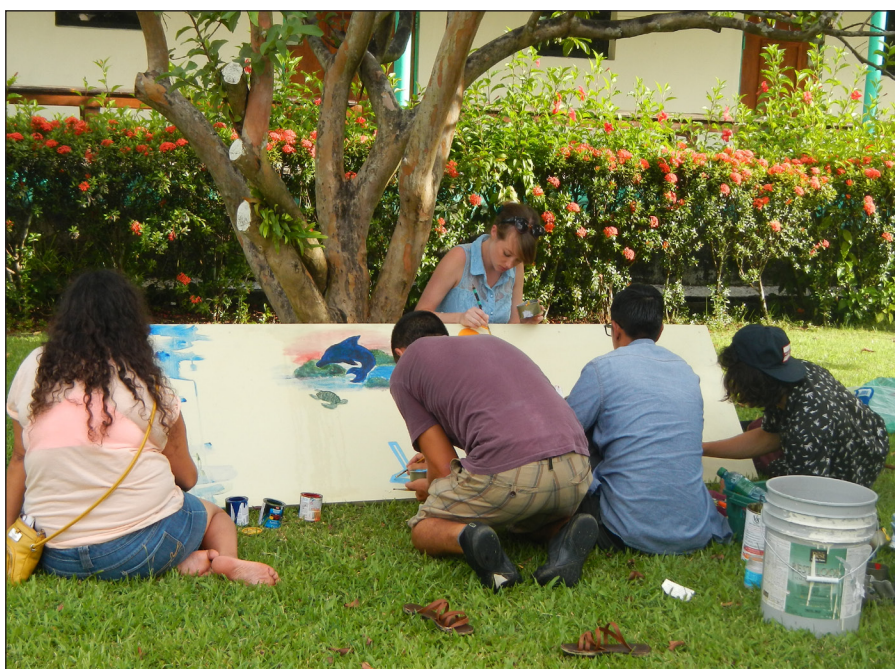
Students of Otis College painting at the PCC Courtyard.

Palau Community College (PCC) bade its farewell to the students and instructors of Otis College of Art and Design last Thursday, June 13, 2013. The group had spent about two weeks in Palau creating a final design for the Palau Freedom Memorial, a monument honoring Palauans who have served and are serving in the United States Military since the Vietnam War.