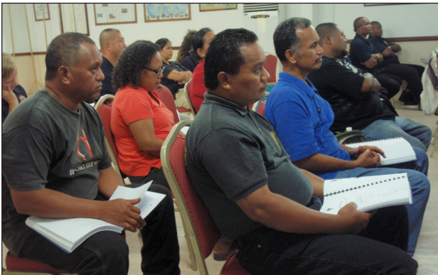
Law enforcement members attending the Crime Workshop.

The Transnational Crime Workshop is held at the Palau Community College (PCC) Assembly Hall. Members of the local law enforcement agencies (e.g. Police Officers) in Palau are currently attending the workshop to improve their knowledge and skills in combatting about criminal activities.