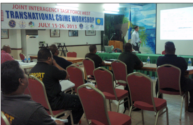
Transnational Crime Workshop at the PCC Assembly Hall.