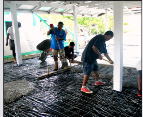
PCC Maintenance Workers building a new hut on the school campus.

Palau Community College is an accessible public educational institution helping to meet the technical, academic, cultural, social, and economic needs of the students and communities by promoting learning opportunities and developing personal excellence.