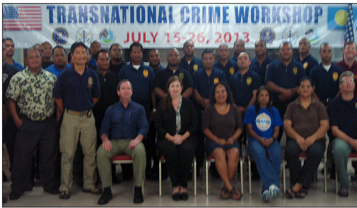
Crime Workshop participants with guests.