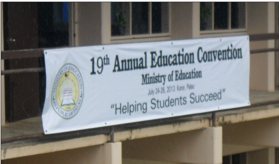
The 19th Annual Education Convention at the Campus of Palau High School.

On Thursday (July 25, 2013) and Friday (July 26, 2013) of last week, the Ministry of Education conducted a convention for teachers in Palau. It was held on the campus of Palau High School (PHS). The 19th Education Convention was divided into different sessions in which participants were taught about different aspects of education. Each session was instructed by an experienced educator or counselor.