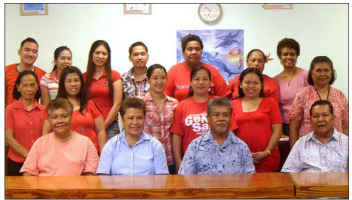
Newly certified caregivers with guests.