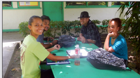
Students around campus during the first week of instruction.

Palau Community College is an accessible public educational institution helping to meet the technical, academic, cultural, social, and economic needs of the students and communities by promoting learning opportunities and developing personal excellence.