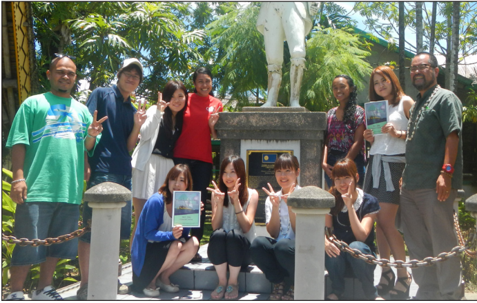
PCC students and the students from Ryukoku University.

On August 13, 2013 seven (7) students from Ryukoku University visited the campus of Palau Community College (PCC). The Ryukoku University is an institute of higher learning in Kyoto, Japan. It began as a Buddhist seminary basing its educational values on five pillars of Buddhism: equality, independence, self-reflection, gratitude, and peace. Ryukoku University is one of the oldest universities in Japan educating over 20,000 students. A prominent part of the school's education is exchange programs. RYUKOKU UNIVERSITY, CONTINUED ON PAGE 3