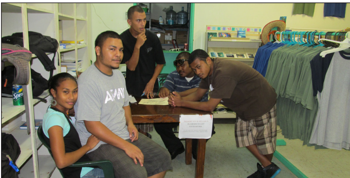
Some of the volunteer workers at the bookstore.