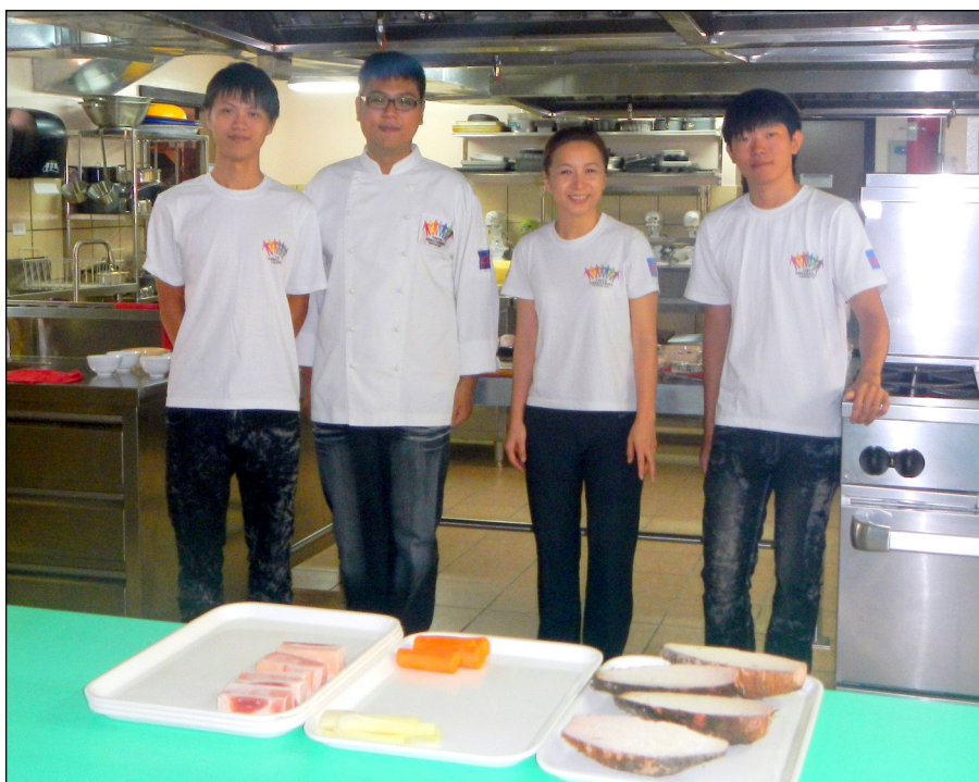
Culinary Arts Students and Chef from Taiwan at the Palau Tourism & Hospitality School.

The Palau Community College (PCC) Tourism & Hospitality Department began its two-week culinary arts class on August 19, 2013. In collaboration with the International Youth Ambassadors Interactive Program (IYAIP), the PCC Tourism & Hospitality Department hosted a course conducted by culinary arts students and a chef from Taiwan. Interested individuals signed up for the two-week culinary arts course. They included local chefs, cooks, and restaurateurs.