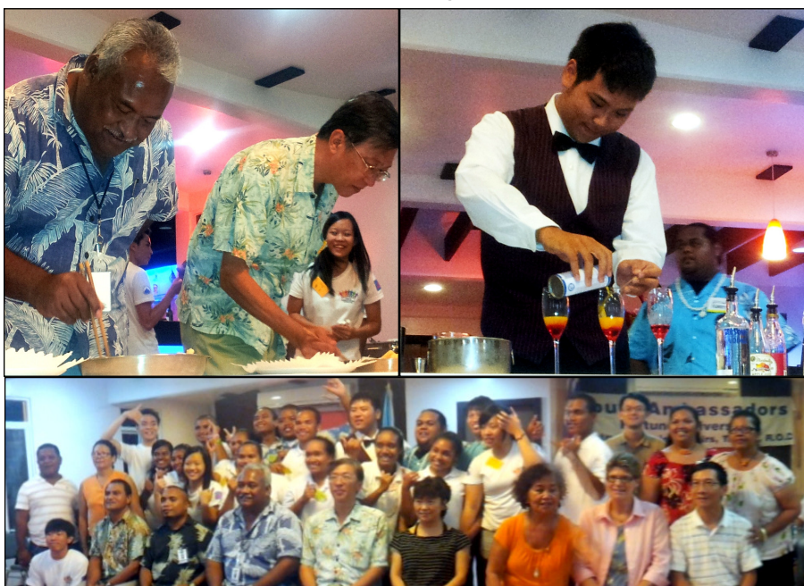
Scenes from the IYAIP Culinary Arts demonstration at the PTHSE.

The Tourism & Hospitality Department of Palau Community College (PCC) hosted a two-week culinary arts course beginning on August 19, 2013 in partnership with the International Youth Ambassador Interactive Program (IYAIP).