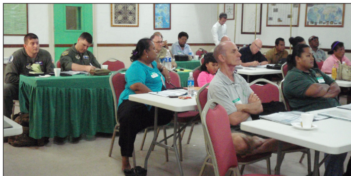
Participants of the workshop held at the PCC Assembly Hall by the Palau National Emergency Management Office (NEMO).

The Palau National Emergency Management Office (NEMO) held a three-day training workshop at the Palau Community College (PCC) Assembly Hall. Beginning on Wednesday, August 27, 2013, the Lightning Rescue Exercise aimed to improve response efforts for pandemic influenza and infection diseases under the "All Emerging Infectious Disease" planning paradigm. It was conducted by the U.S. Army Pacific Command Surgeon, the executive agent of the U.S. Pacific Command for infectious disease and civil support. NEMO, CONTINUED ON PAGE 3