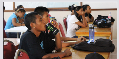
Students attending the workshop.

Palau Community College is an accessible public educational institution helping to meet the technical, academic, cultural, social, and economic needs of students and communities by promoting learning opportunities and developing personal excellence.