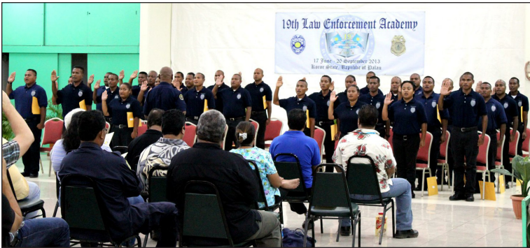
Swearing-In of the Law Enforcement Academy cadets.