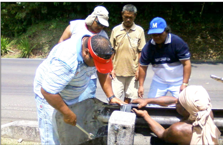
Participants of MAP repairing a guardrail.

Employees from the Republic of Palau Bureau of Public Works and the Koror State Department of Public Works recently completed training courses in guardrail maintenance and road sign maintenance. Guardrails are meant to protect passengers and their vehicles in curves and on steep drop-offs along roads and highways. But if they are not properly maintained, they can be a cause of injury. Regular and systematic inspection and maintenance of guardrails are important, and this was the topic of two days of training in a recent MAP course delivered by Lester Rekemesik. MAP, CONTINUED ON PAGE 4