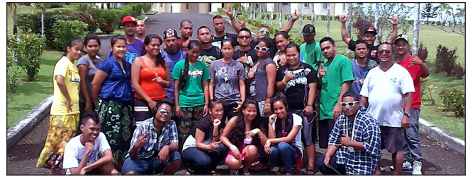
New dorm students at Ngerulmud.