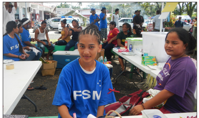
Federated States of Micronesia (FSM) students during OBF.

Thank you all for contributing to the Palau Community College Endowment Fund!