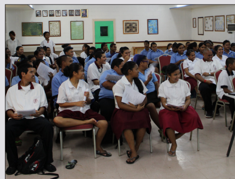
High school students attending the Upward Bound Orientation at the PCC Assembly Hall.

Palau Community College is an accessible public educational institution helping to meet the technical, academic, cultural, social, and economic needs of students and communities by promoting learning opportunities and developing personal excellence.