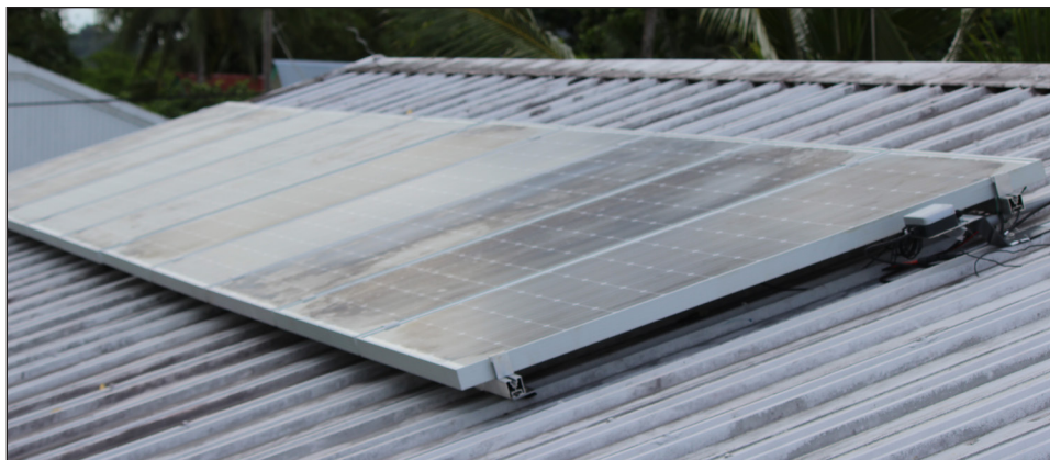
The 1.7 KW Solar Array on the roof of the PCC Tekrar Building.

PCC would like to give a special thanks and recognition to SPC North-REP Palau for initiating the solar panel project as well as making it possible for the college to offer a new course about PV system installation. We are pleased that the college is able to offer this technology to our students at a time when photo voltaic systems are becoming a regular feature of homes, buildings, and other facilities in Palau.