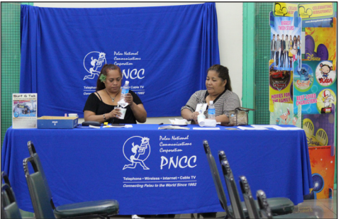
Palau National Communications Corporation