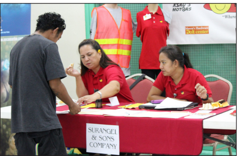
Surangel & Sons, Company