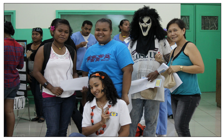
Participants during the LRC Career Expo at the PCC Cafeteria.

On Thursday, October 31, 2013, the Learning Resource Center (LRC) of Palau Community College (PCC) hosted a Career Expo at the PCC Cafeteria. The LRC Career Expo invited numerous businesses, ministries, and agencies in Palau to share career experiences with the students of the college. Booths were set up for each career with information available for interested students. In addition, a panel of speakers was also assembled to provide an in-depth explanation about the Palauan workforce.