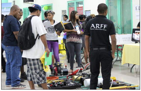
Ministry of Public Infrastructure, Industries & Commerce