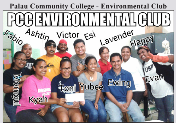
Members of the PCC Environmental Club donated $100.00 to the PCC Endowment Fund.

Palau Community College (PCC) would like to thank the following businesses, offices, and individuals for contributing to the PCC Endowment Fund: