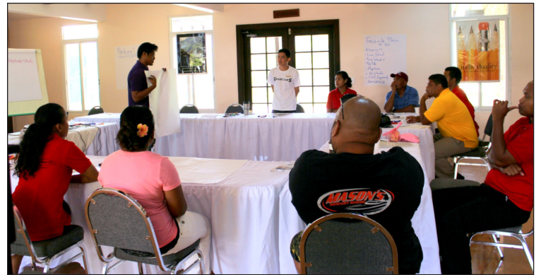
Participants of the AliiHost Workshop at the Tourism & Hospitality Building on the PCC Campus.

On Friday, October 25, 2013, AliiHost conducted its workshop a the Tourism & Hospitality Building on the Palau Community College (PCC) Campus. AliiHost is a customer service training program endorsed by the Tri-Org which consists of the Belau Tourism Association, Palau Visitors Authority, and the Palau Chamber of Commerce. Participants of the AliiHost workshops learn about customer service topics including communicating with customers in a professional courteous manner, identifying and anticipating problems in order to minimized its effects, and handling customer complaints. AliiHost presents a WorldHost Training Fundementals Certificate, which provide certifiable credentials for businesses and their workers, to participants upon completing the workshop.