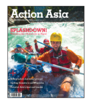
"At the forefront of adventure travel since its inception in 1992, ACTION ASIA is a 'must read' for outdoors types who want to do more with their time. Learn where and when to go as well as what to do when you are there with our network of world-class adventure photographers and feature writers keeping the accent always on discovery. "