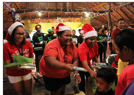
ASPCC Santa Helpers