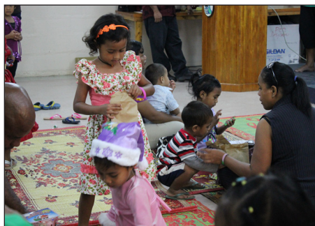
Day Care Children Opening Presents