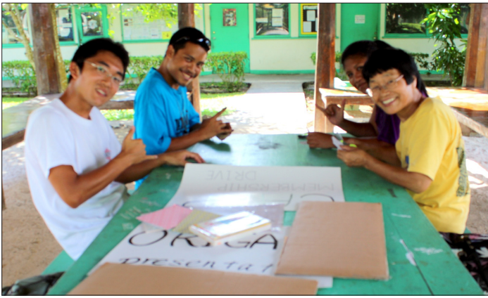
Membership Drive for the CARP Student Organization.

On Wednesday, December 11, 2013 a membership drive was held for the Collegiate Association for Research of Principle (CARP), a student organization currently in its building process.