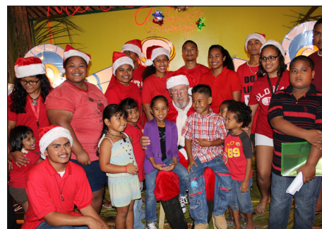
Santa and his Helpers