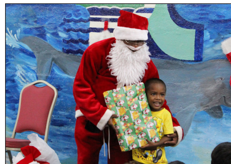
Children Meeting Santa Claus