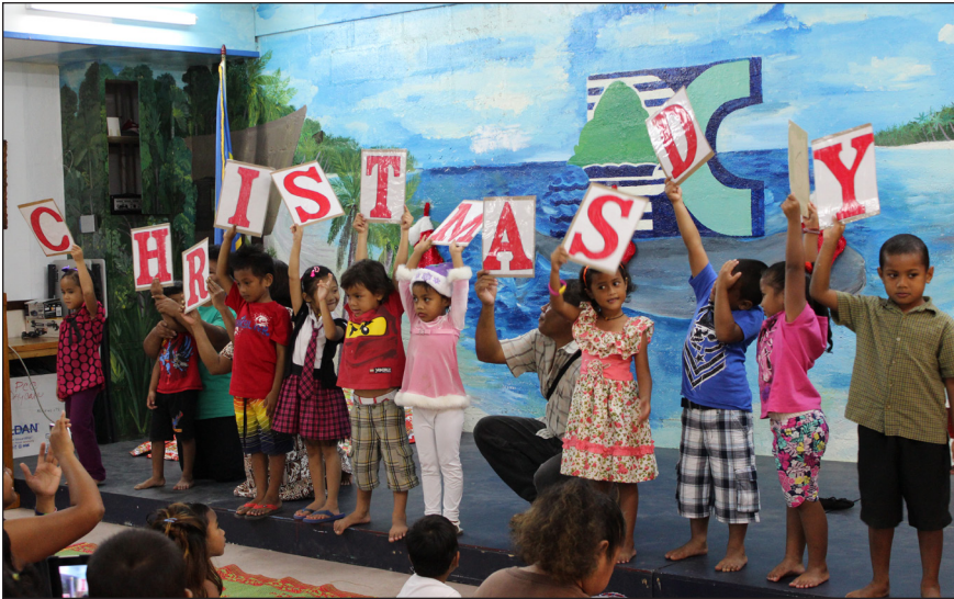
Children performing during the PCC Day Care Christmas Program.

Palau Community College (PCC) participated in children Christmas programs this past week. On the morning of Thursday, December 19, 2013, the PCC Day Care Center held a Children's Christmas Program at the PCC Assembly Hall. Parents were invited to watch their children participate in Christmas performances, such as singing holiday carols. The Day Care children were also able to meet Santa Clause who gave each of them a Christmas gift.