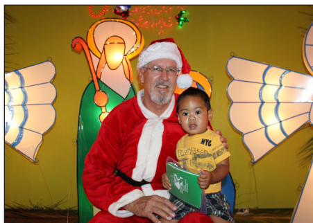
Santa Claus Meets the Children