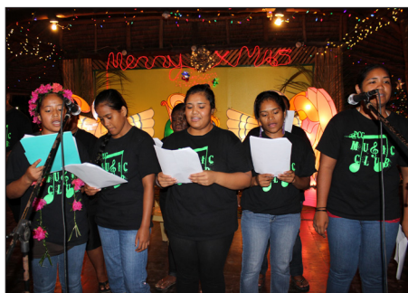
PCC Music Club Performance