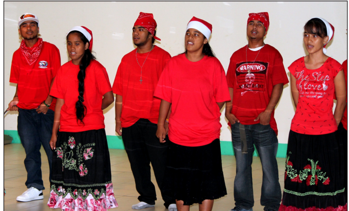
PCC\ Dorm\ Students\ performing\ during\ their\ Christmas\ Program.

On the night of Wednesday, December 18, 2013 the students residing at the Palau Community College (PCC) dormitories held a Christmas Program at the PCC Cafeteria in celebration of the holidays. The students prepared Christmas entertainment that included musical and dance numbers. Dorm students also performed according to island groups with respective students representing Yap, Palau, Chuuk, Pohnpei, Kosrae, and the Marshall Islands.