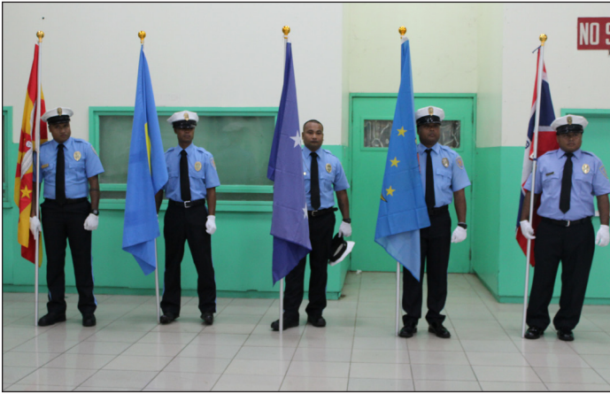
Flags representing the States of Palau whose conservation officers participated in the 20th Law Enforcement Academy.

The 20th Law Enforcement Academy of Palau held a graduation for Palau's newest cadets on Friday, January 24, 2014. Over a thirteen-week period, participants of the Law Enforcement Academy underwent rigorous physical training and studying to improve their abilities to serve as law enforcement officers. Included in the group are employees of the Bureau of Customs, state rangers, Airport Police, and individuals with personal interests in the program.